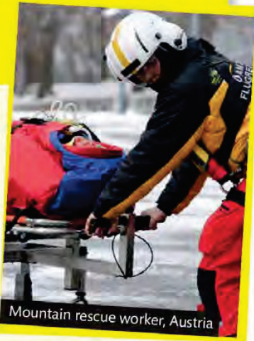
Mountain rescue worker, Austria